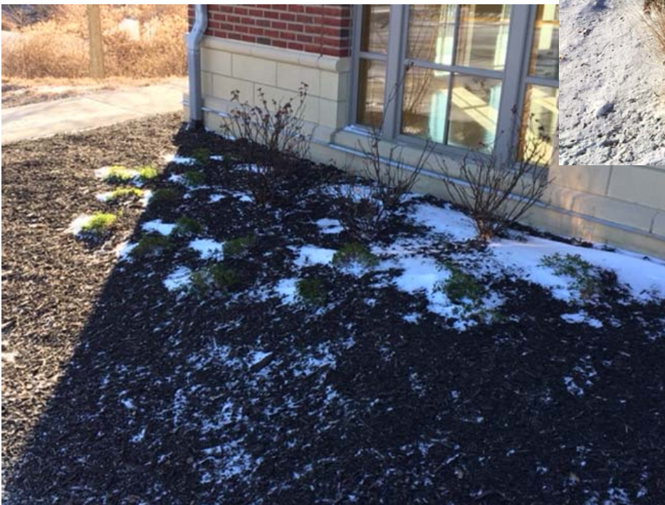
Winter Landscaping at Sherwood Community Center