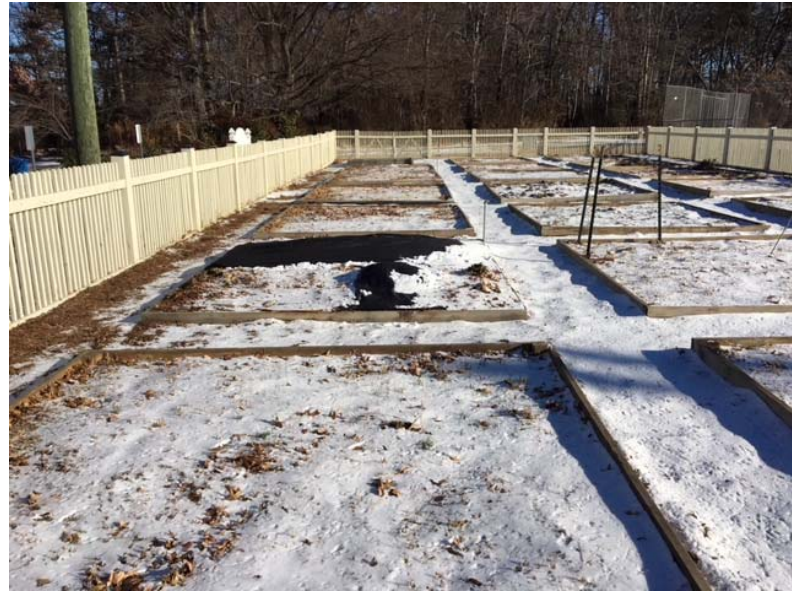
Scout Project at Kutner Park Community Garden included laying fabric and mulch in the walkways for weed control.