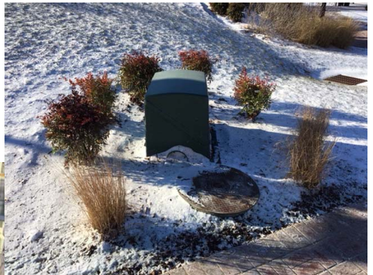
Winter Landscaping at Old Town Square