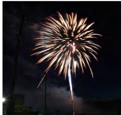
SPECIAL EVENTS & ATHLETICS