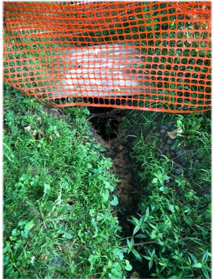
Ratcliffe Park: Sinkhole at top of hill.

Will require excavation and replacement of storm water pipe. Parks installing a French drain in playground as well.