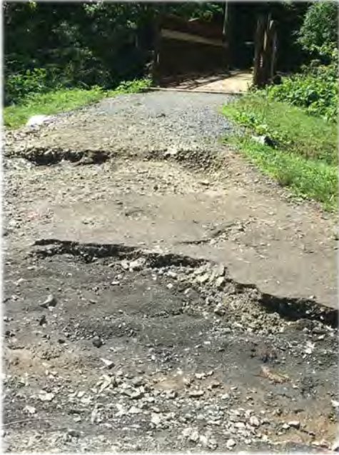
Judicial Drive: Trail washout.

With double the amount of rain in June, we have been staying on top of flooding and storm damage in our parks.