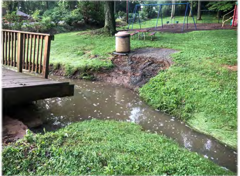
Cobbdale Park: Breakaway bridge worked!