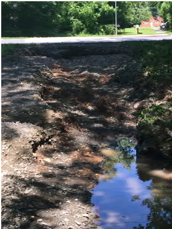
Hallman Drive: Trail washout.