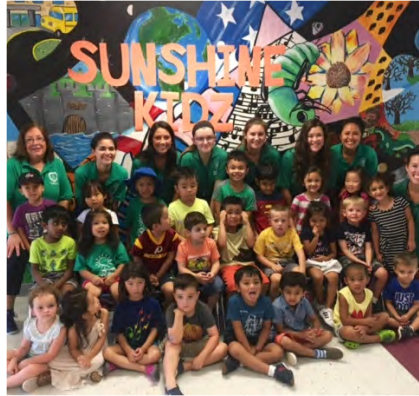
SHERWOOD PROGRAMMING GREEN ACRES & SENIOR CENTER