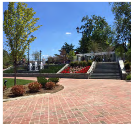
PARKS & TRAILS