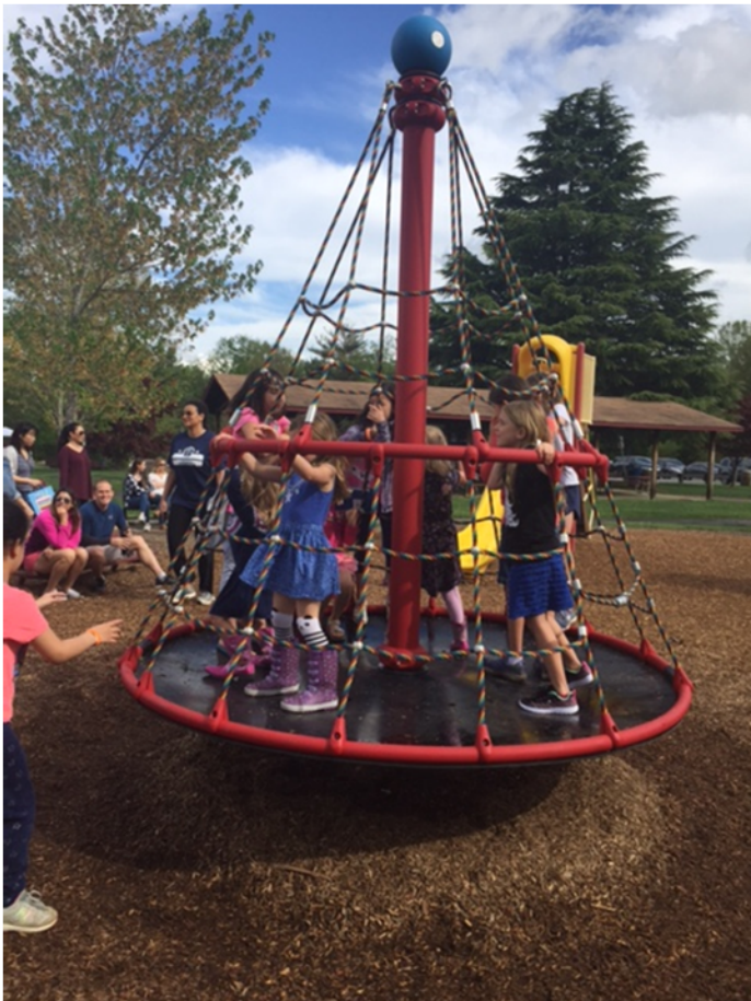
New Tsunami at Van Dyck Park is a big hit!