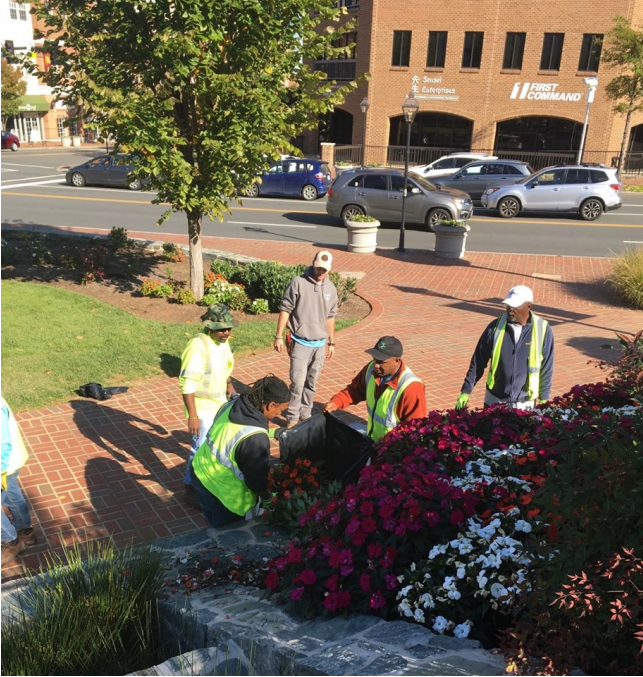
10/15/19— OTS Gardening/Weeding