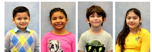
"School" Picture Day!