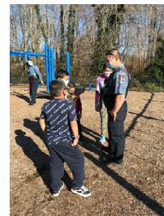
Biweekly visits from the City Police!

Along with our Sherwood Center programs we are offering a fully recreational Spring Break Camp at Green Acres for those who attend our Connected Care Program. We are not offering this program to people outside of the program so we can continue to cohort the classes safely.