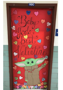
Valentines Day Door Contest!