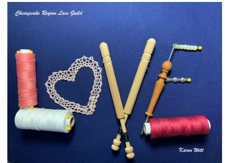
Looking for Love in Old Town!