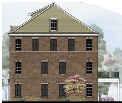
Lot 10 (HIGH RISE END UNIT)