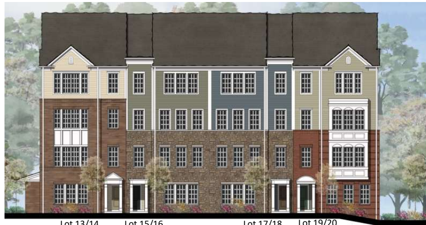
Lot 13/14 Lot 15/16 Lot 17/18 Lot 19/20