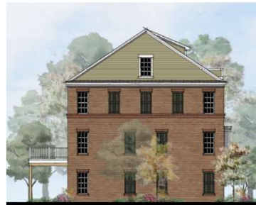
lot 40 (HIGH VIEW ELEVATION)