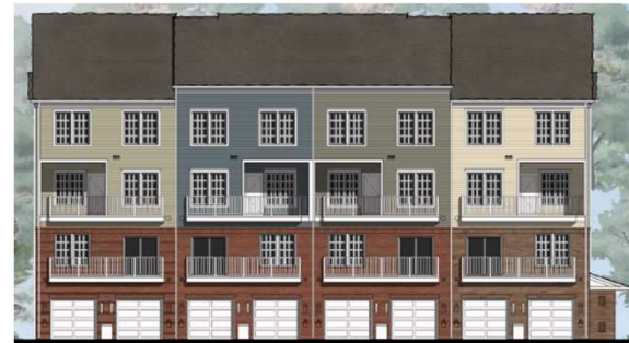
LOT 19/20 LOT 17/18 LOT 15/16 LOT 13/14 REAR ELEVATION