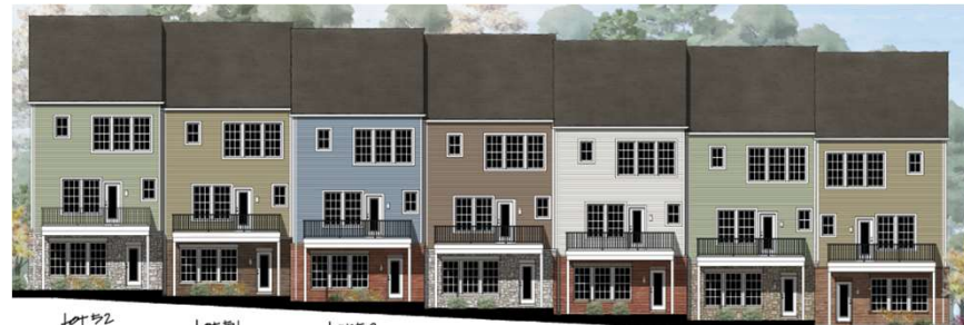
lot 52 lot 51 lot 50 lot 49 lot 48 lot 41 lot 40