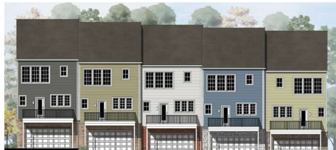
Lot 29 Lot 28 Lot 27 Lot 26 Lot 25