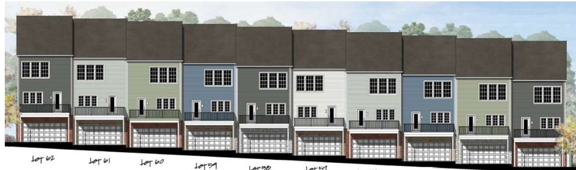
Lot 62 Lot 61 Lot 60 Lot 59 Lot 58 Lot 57 Lot 56 Lot 55 Lot 54 Lot 53