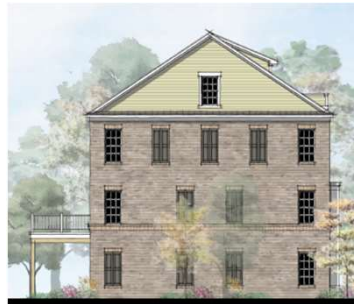
Lot 25 (HIGH VISE ELEVATION)