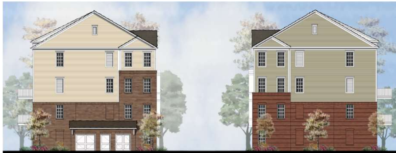
LEFT ELEVATION LOT 13/14