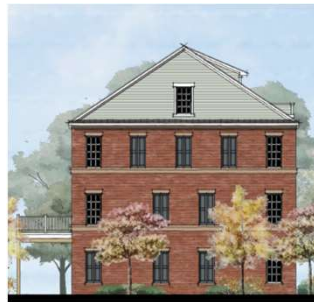
Lot 21 (HIGH VIB EXTERIOR)