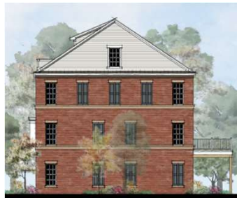
lot 34 (HIGH VIEW ELEVATION)