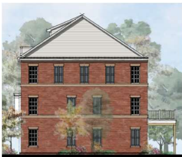
Lot 62 (HIGH VIB EXTERIOR)