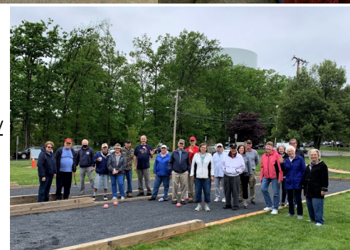
(2022 season Bocce players)