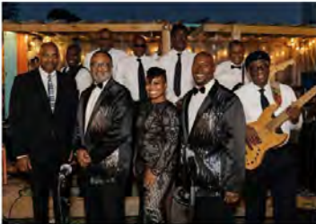
SUDDEN M PAC

Sudden M-Pac Band plays legendary pop, R&B, and funk classics. Their high-energy shows are known for musicianship and rich, sultry vocals.