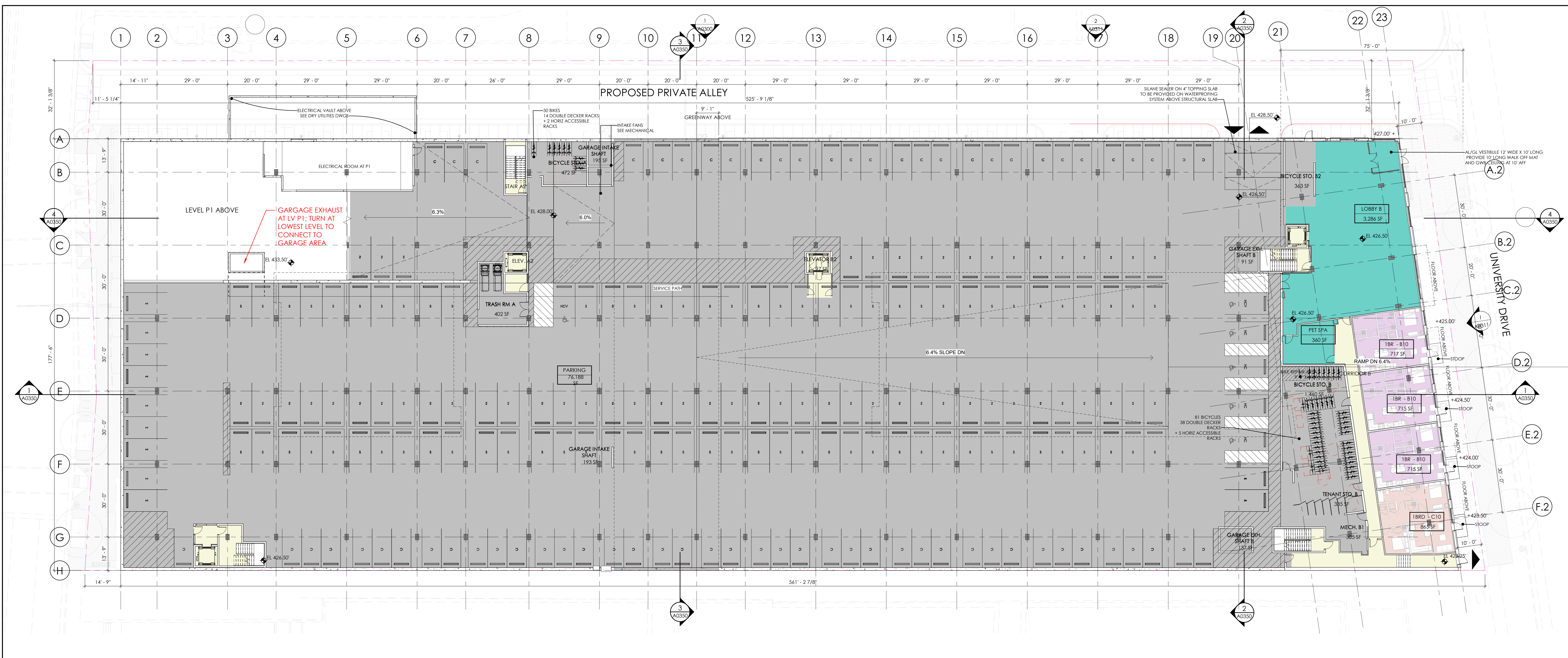
2 OVERALL LEVEL P2 FLOOR PLAN SCALE: 1/16" = 1'-0"

PARKING - LEVEL P2 STANDARD - 144 COMPACT - 69 HANDICAP VEH - 4 SUBTOTAL - 217