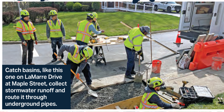
Catch basins, like this one on LaMarre Drive at Maple Street, collect stormwater runoff and route it through underground pipes.

Lorraine Koury, a retired family law continued on page 4