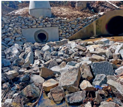
The Mathy Drive culvert experienced severe erosion near two outfalls. The city reinstalled the pipe, added riprap (large rocks) for erosion control and outfall protection, added a headwall to stabilize the pipe and prevent future dislodging, and backfilled the area with fresh compactable dirt.

We assess, repair, and build stormwater utility system updates. In the past year alone, we have rebuilt 19 structures and 16 outfalls. Our work is mainly preventative, so what we do helps the city avoid stormwater utility failures — and,